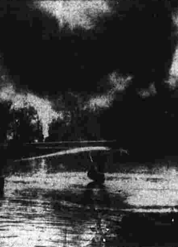
Fire seriously damaged the U. S. Navy's big flying battleship 'Mara' late yesterday afternoon when, according to Ken Edell, chief...